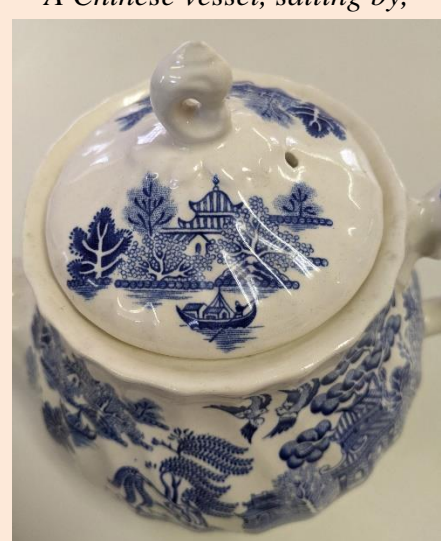
A bridge with three men, sometimes four, A willow tree, hanging o'er, A Chinese temple, there it stands, Built upon the river sands,