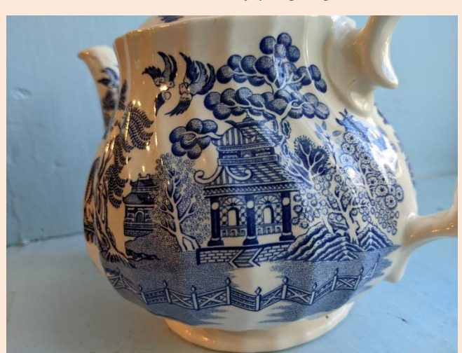
A Chinese vessel, sailing by,